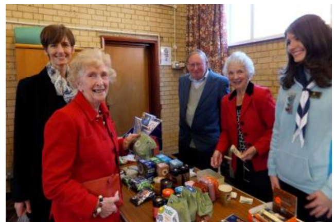
Fairtraid stand – always here on the last Sunday of the month – 'Come Buy'!