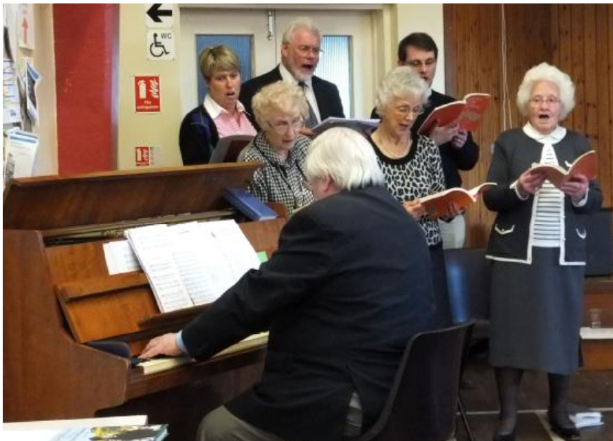
In Good Voice