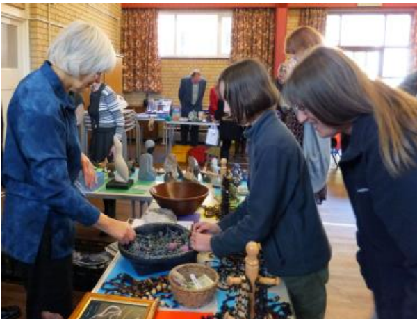
Artpeace say "you can't have too many Wee Beastie keyrings"!

Members and friends can sometimes enjoy browsing at stalls set up in the Church Hall after the service. FairTraid is a regular on the last Sunday of the month. Artpeace sets up only every now and then and is always a star attraction, ideal for finding that gift with a difference.