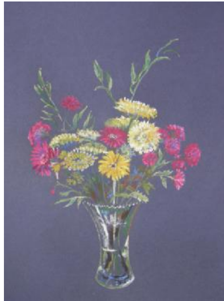
Bridget's flowers in pastel